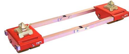
Model Y20 Straight-line