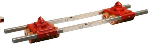
Model Y30 Straight-line