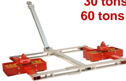
Model X30 Steerable