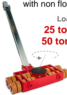
Model A25 Steerable Front

Load Capacity: 25 tons each -or- 50 tons combined