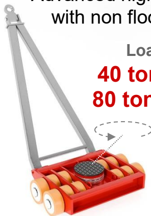
Model A40 Steerable Front