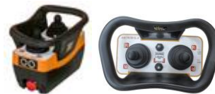
Remote control (cordless) Forward, reverse, stop, left/right (360°), speed.