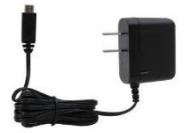
Remote control charger 110V. 50/60HZ; 250mA.