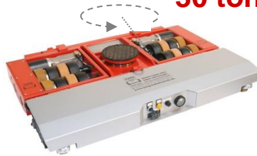
Model EP15 Powered Steerable Front

» Each Model Sold Separately Mix & Match as Needed! «