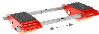
Model B40 Adjustable-Width Rear