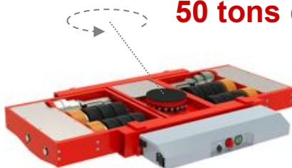
Model EP25 Powered Steerable Front

» Each Model Sold Separately Mix & Match as Needed! «