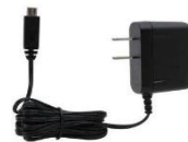
Remote control charger 110V. 50/60HZ; 250mA.