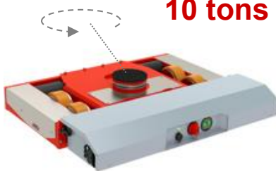
Model EP5 Powered Steerable Front

» Each Model Sold Separately Mix & Match as Needed! «