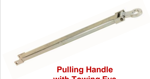
Pulling Handle with Towing Eye Length: 58.3"

Capacity Rating Dolly built to meet or exceeds ASME B30.1.