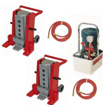
Two 30 ton jacks with two 9 ft. hoses & electric pump