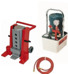
One 30 ton jack with one 9 ft. hose & electric pump