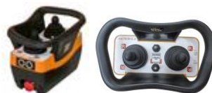
Remote control (cordless) Forward, reverse, stop, left/right (360°), speed.