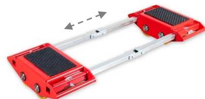
Model B40 Adjustable-Width Rear