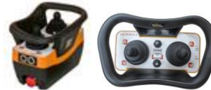
Remote control (cordless) Forward, reverse, stop, left/right (360°), speed.