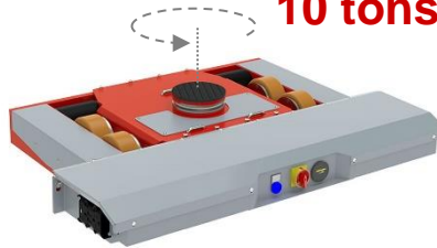
Model EP5 Powered Steerable Front

» Each Model Sold Separately Mix & Match as Needed! «