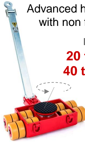
Model A20 Steerable Front

Load Capacity: 20 tons each -or- 40 tons combined